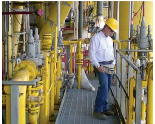
Our team of engineers is dedicated to provide a full range of site services