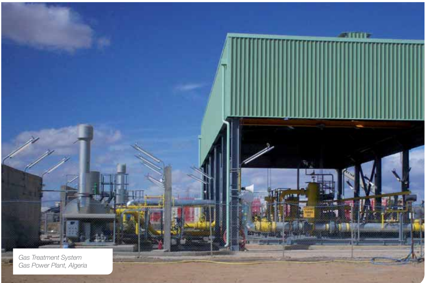
Gas Treatment System Gas Power Plant, Algeria