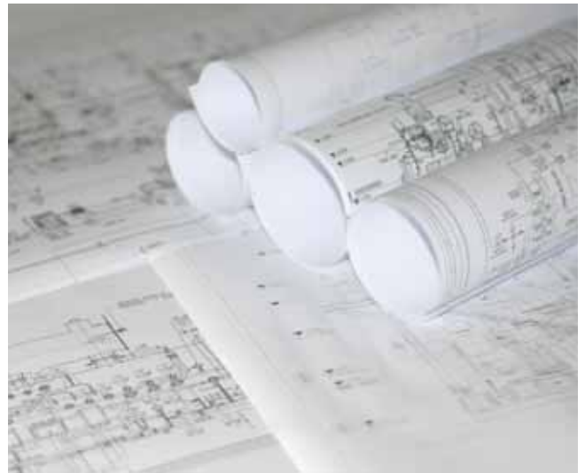
Over 40 years of engineering know-how to deliver tailored process solutions

Focusing on meeting and exceeding our clients' expectations, with a solid and financially stable organisation, Metano Impianti is your ideal long-term partner to face the ever increasing challenges of the Oil, Gas and Power Generation projects.