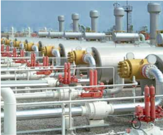
Water Bath Heaters Compressor Station, Turkey