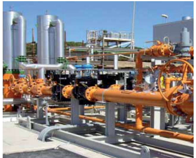
Gas Treatment System Gas Power Plant, Italy

Pressure Reducing and Metering Stations as natural gas is usually transported highly pressurized through pipelines, it needs to be conditioned before it is delivered to the final consumer. Metano Impianti is keen to propose the most advanced alternatives to fulfil the clients' requirements.