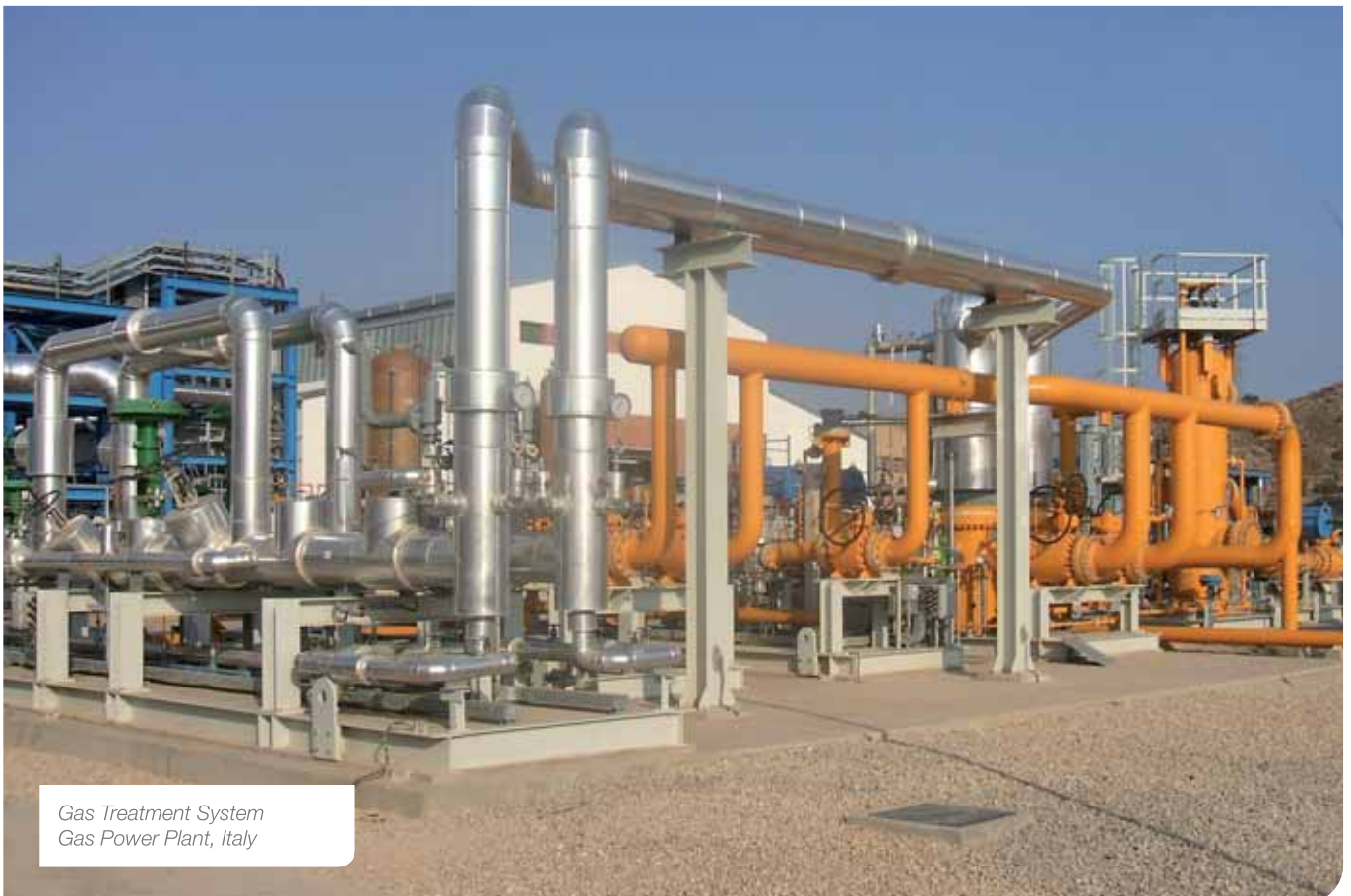
Gas Treatment System Gas Power Plant, Italy