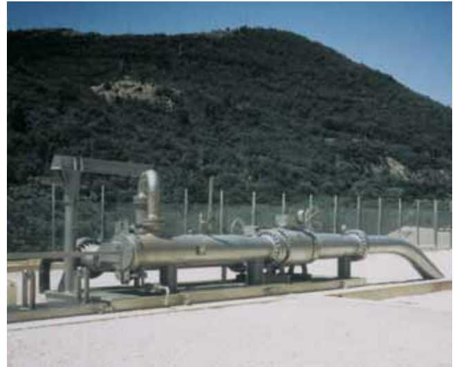
Pig Launcher System Pigging Station, Italy