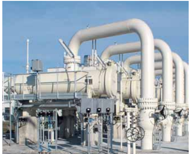
Gas Filter Separators Compressor Station, Austria

Three-phase Separators designed to separate production fluids into measurable streams, using residence time in conjunction with vessel internals, which usually include inlet device, calming baffles, weir and vane pack or demister (on the gas outlet), all designed by Metano Impianti.