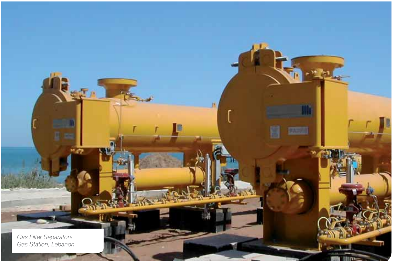
Gas Filter Separators Gas Station, Lebanon