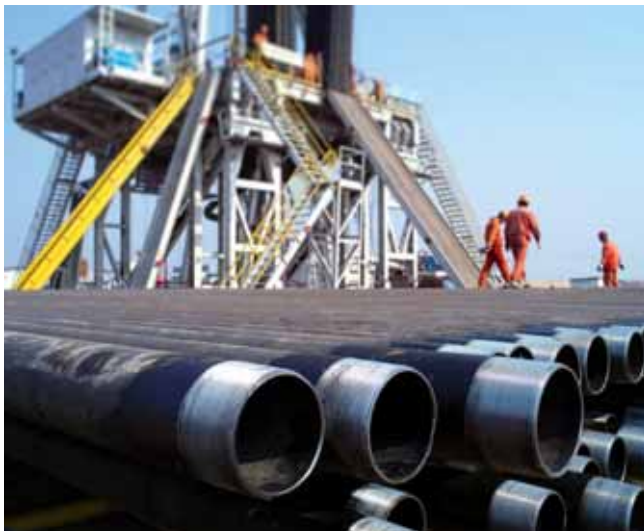
Our core business is integrated with agency and trading activities

Metano Impianti continues to serve you after the delivery.